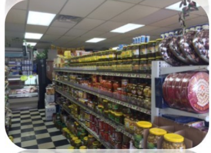
مخللات وزيت Olive oil &amp; pickles