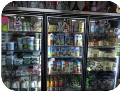
ألبان وأجبان Dairy Products