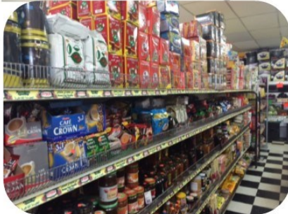
قهوة وشاي ومربيات Coffee &amp; Tea