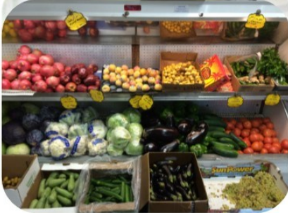
خضار وفواكه Fruits &amp; Vegetables