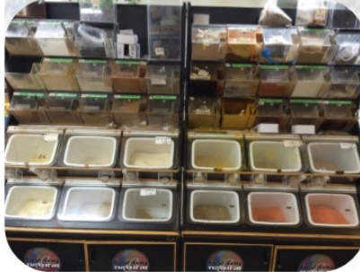
بهارات متنوعة Spices