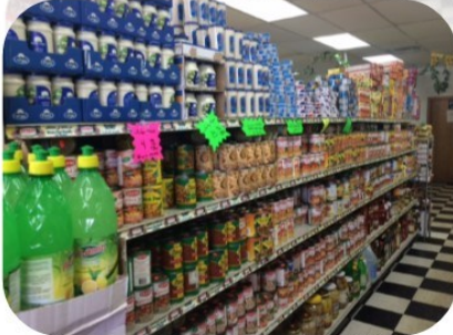
تشكيلة من المعلبات Canned food