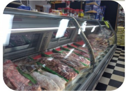
قسم اللحوم Meat Section