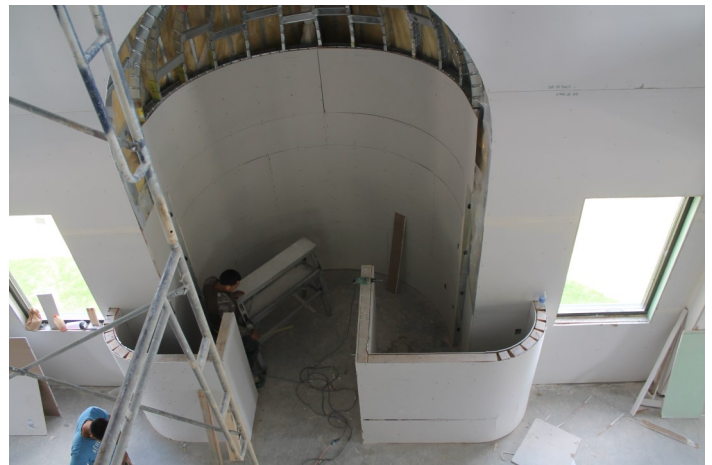
Photos include exterior of building, second floor dome in front foyer, lower level hall and minbar.

Soon, the ISM will set a date for the official “Open House” program. The plan of the ISM and the ISM West Task Force is to have a formal “ribbon cutting” ceremony to which elected officials, local dignitaries, interfaith partners and other friends will be invited. Of course, the entire facility will be open to the public.