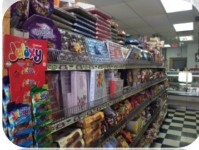
الشوكولا والحلويات Sweets